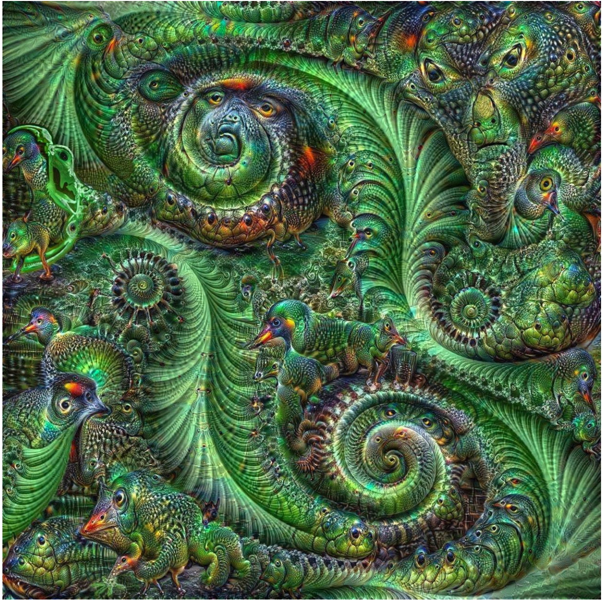
An example of “Vivid Dream” Art by Deirdre Barrett

(As published in The Oak Ridger's Historically Speaking column the week of May 28, 2018)